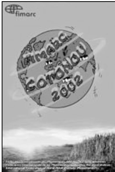
World Assembly 2002 - Cotonou (Benin)