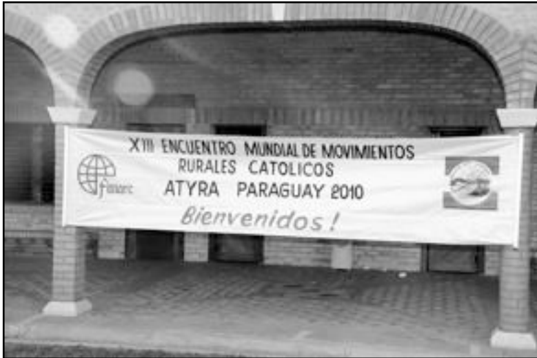
World Assembly 2010 - Atyra (Paraguay)