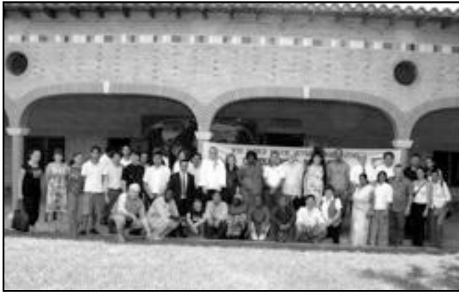
World Assembly 2010 - Atyra (Paraguay)