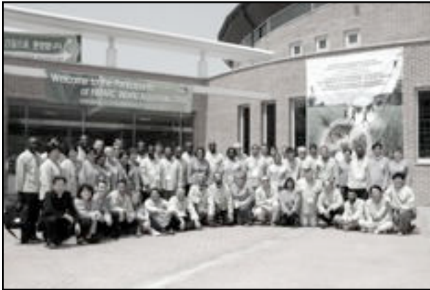
World Assembly 2006 - Daejeon (South Korea)