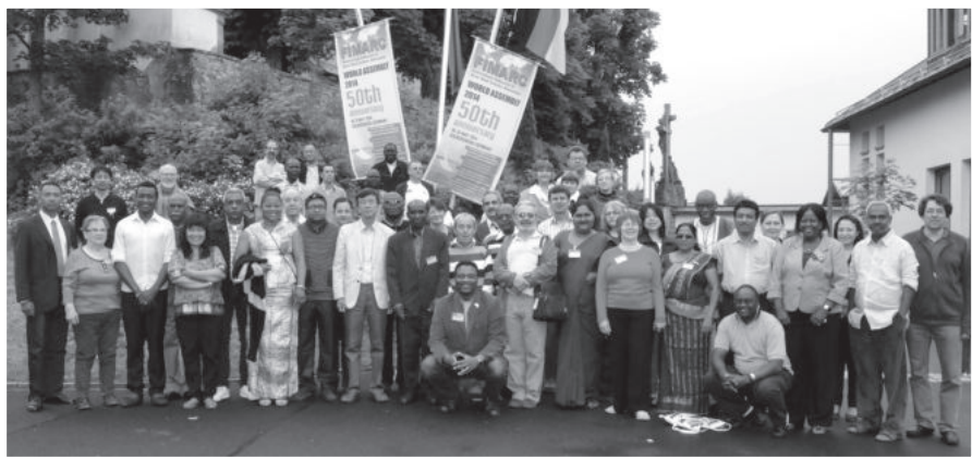
Participants of the FIMARC World Assembly 2014