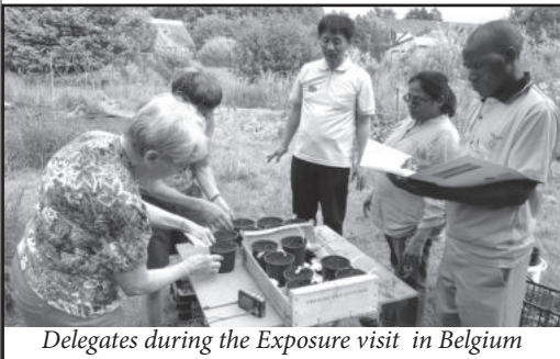
Delegates during the Exposure visit in Belgium