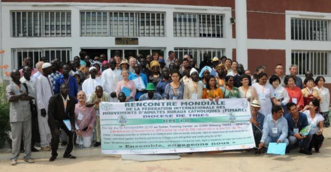
The participants of 15 th FIMARC World Assembly