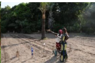
Vegetable cropping in Casamance