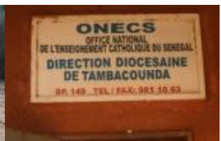
The Catholic teaching in Senegal