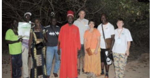
FIMARC delegates welcomed in Casamance

A 3-day immersion period was scheduled at the beginning of the stay of the delegates. This time it was an usual practice of FIMARC assembly in order to allow delegates to perceive the diversity and realities of Senegalese situations. In response to the wishes of MARCS to manifest the FIMARC presence to the whole of the Senegalese Church. This immersion took place in 6 of the 7 dioceses of Senegal. Ten groups of 4 or 5 delegates were welcomed by local MARCS officials in the dioceses of Thiès, Dakar, Kaolack, Ziguinchor, Kolda and Tambacounda. For a linguistic question, the 14 Korean delegates remained grouped in the region of Thiès. This immersion time has highlighted several aspects of MARCS members' engagement in Senegalese rural society :