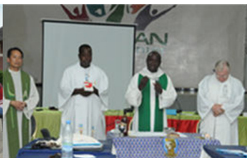
The international character of our celebrations with the chaplains from Korea, Burkina Faso, Senegal, Argentina