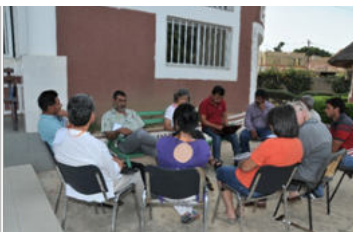
Continental meeting of the Latin America delegation and portage of an intermovement projects