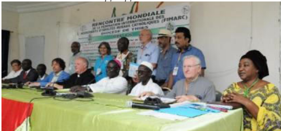
Opening of The World Assembly : the official tribune