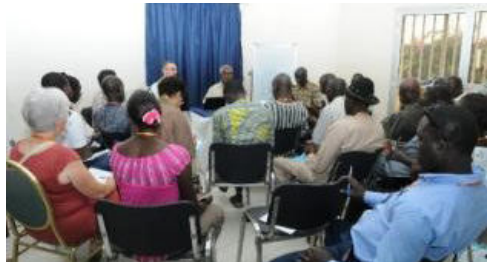
The Market Place, an interactive exchange about the PDLP working method

Similarly, a “marketplace” type of exchange time has highlighted 3 promising