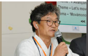
President of KCFC, the very active movement in South Korea