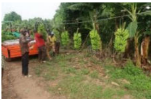
Banana harvest in Nguène