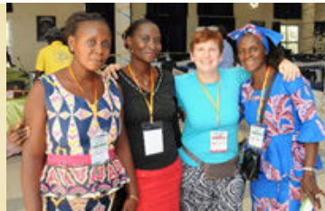
Parity Men and Women: a wealth to become in our movements