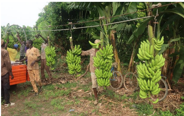
MARCS members' investment in cooperative agriculture: banana production in Nguène (Tambacounda region))