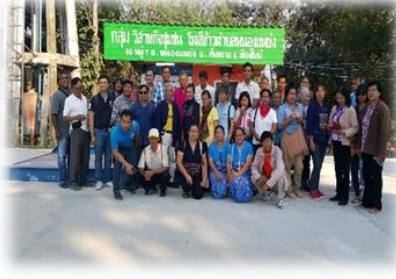
Visit at the Community rice mill, Nong yang village, San sai district, Chiang Mai