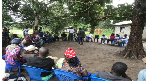
Some Key Conclusions and final proposals