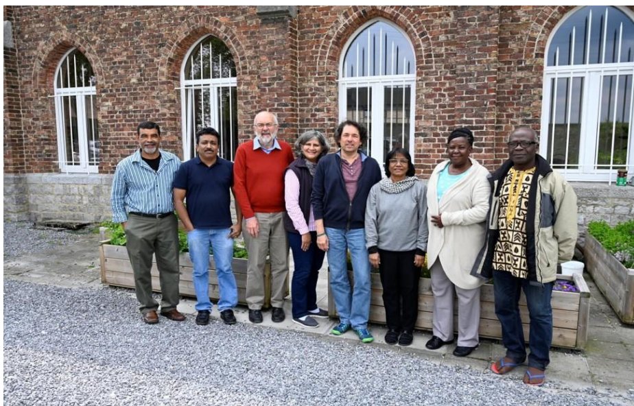
FIMARC Exco members during the meeting in 2019

The Exco 2019 was held in Assesse, Belgium after the formation session on Intergenerational Transfer of Knowledge in Rural Areas . Exco made a concrete planning for the strong and committed engagement of FIMARC to build the initiatives for the transfer of knowledge in rural areas at different levels, approved the work and financial report of the movement, provided inputs for the engagement of FIMARC at the Human rights council, FAO, CFS, UNESCO and also approved the resolution on Intergenerational Transfer of Knowledge . Exco evaluated the work of the continental movements, made the operational plans of the movement in different levels and updated our lobby advocacy actions.