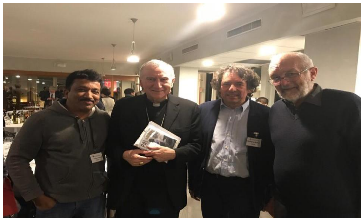
FIMARC Bureau Members with Cardinal Pietro Parolin (Secretary of State, Vatican)

The general Assembly of the Vatican Forum of the Catholic Inspired Organizations was held from 5-7 December 2019 at the Villa Aurelia in Rome. The general theme of the forum was 'Towards a More Inclusive Society'. Different thematic presentations by the eminent panelists enlightened the topics such as Human Rights, Development, Health, Education, Family, Youth and Migration.