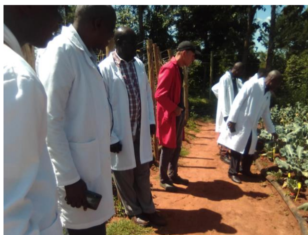
Field exposure visit to crow pact on seedlings extabishment and crop management