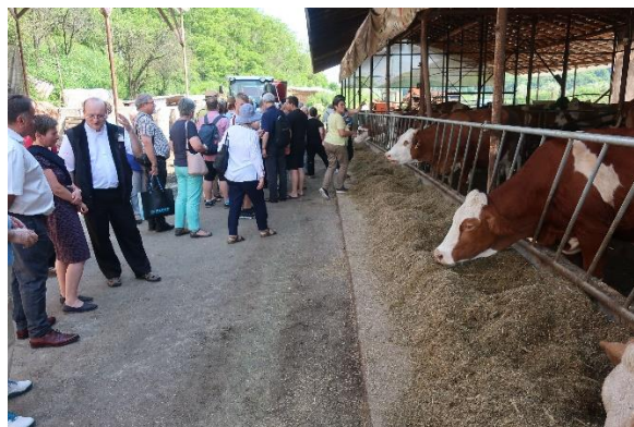
Cluj, Romania : Understanding the rural worlds in eastern and western Europe, through a seminar and a trip to a village community.

The Cluj seminar showed the need to take into account the cultural diversity of the different regions within Europe and to work towards building a Europe that stands on its two feet, from West and East.