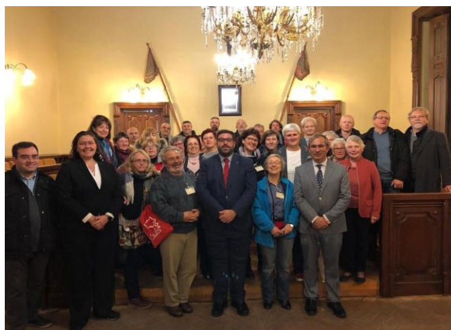
Participants of Avila Meeting