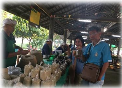
Final Visit at the organic market, Mae Heai district, Chiang Mai