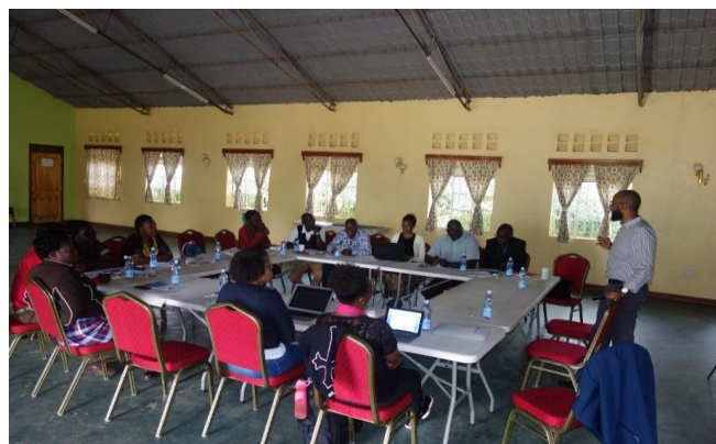
Capacity building with KRCS to discuss on policy issues and Resource Mobilization