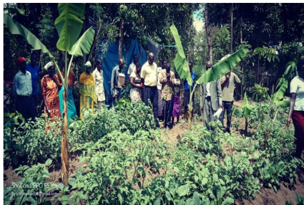
Sustainable organic agriculture family visit to one of boresha matisi group memebre in Bungona West